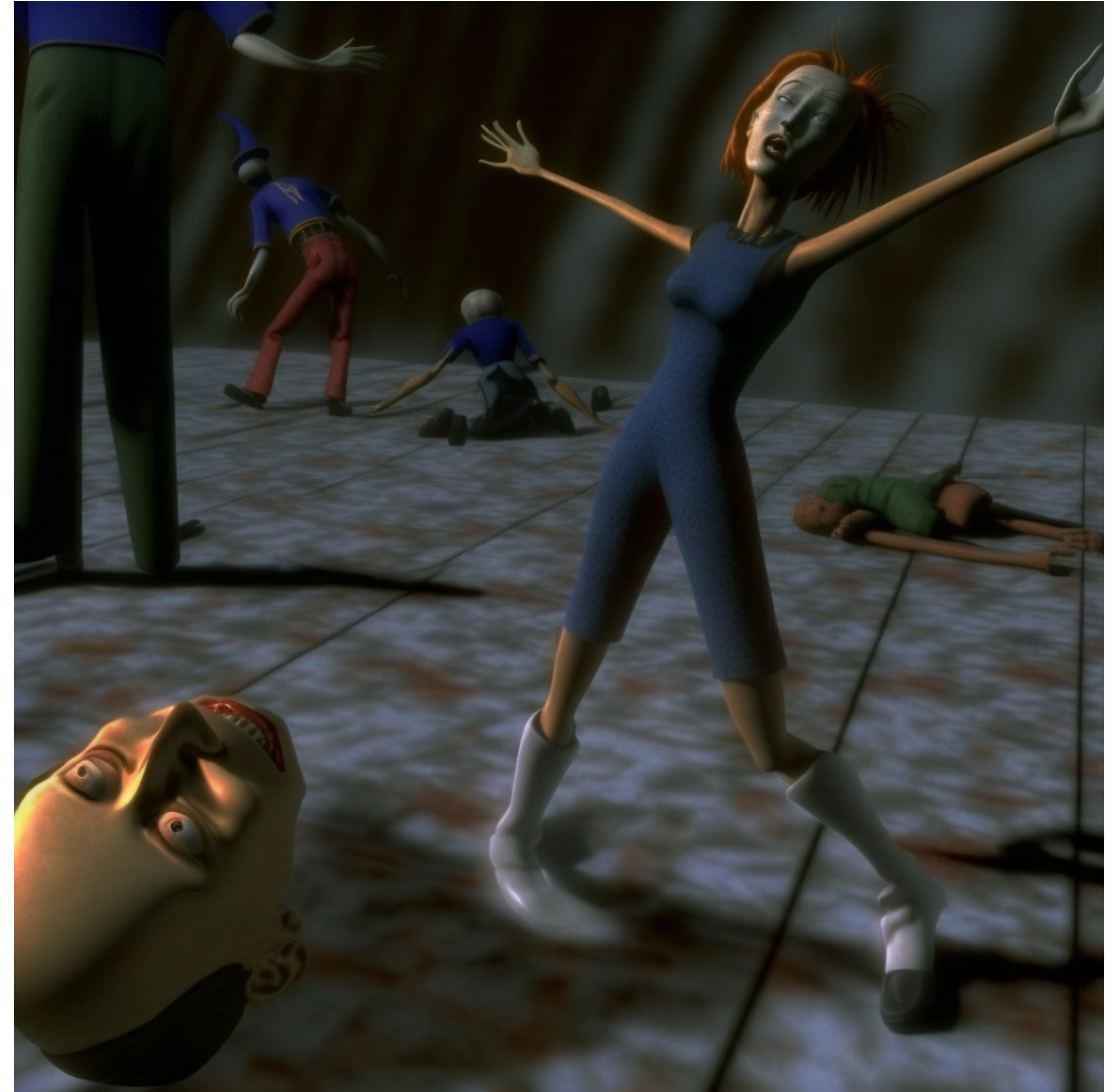
Break a Leg!