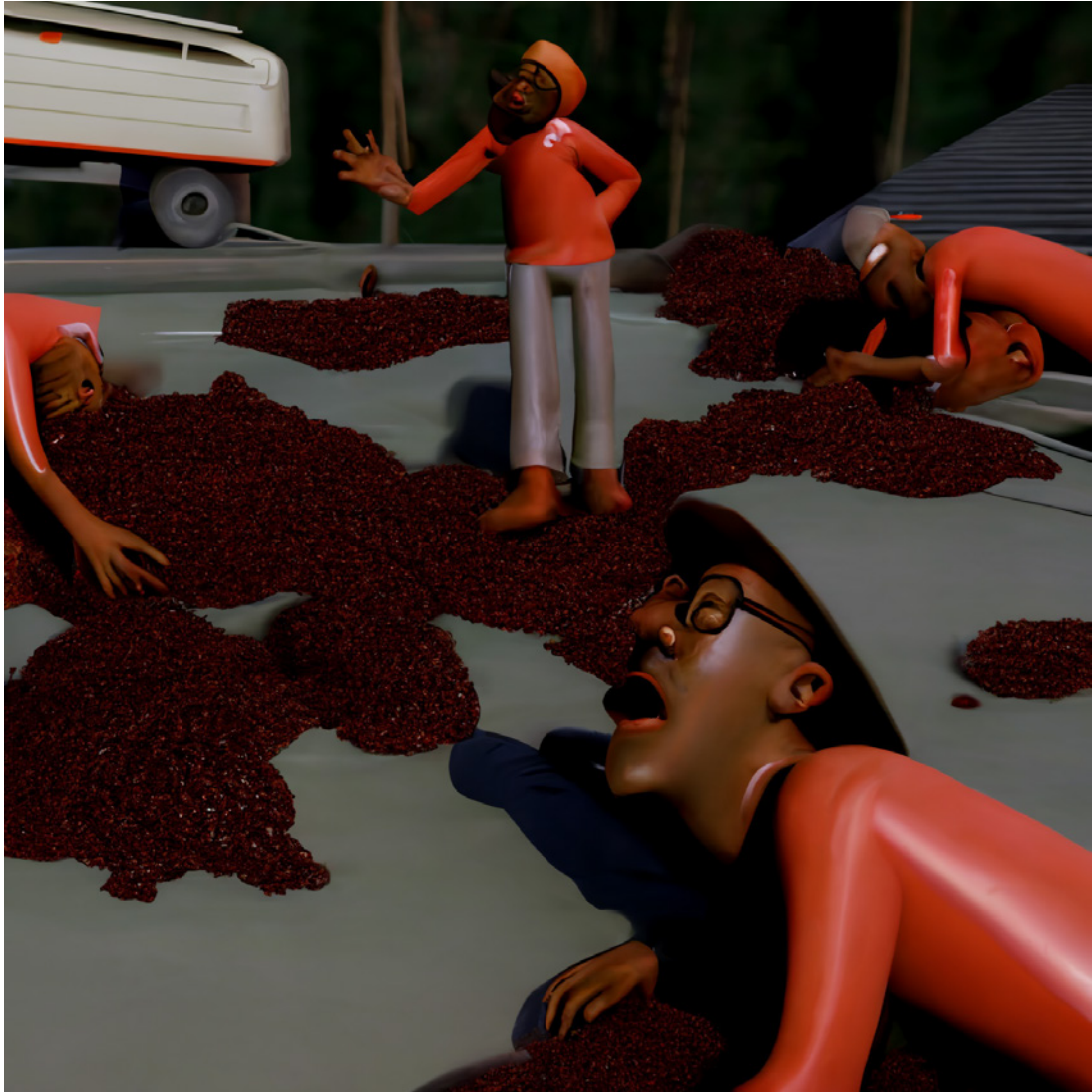
Spill the Beans.