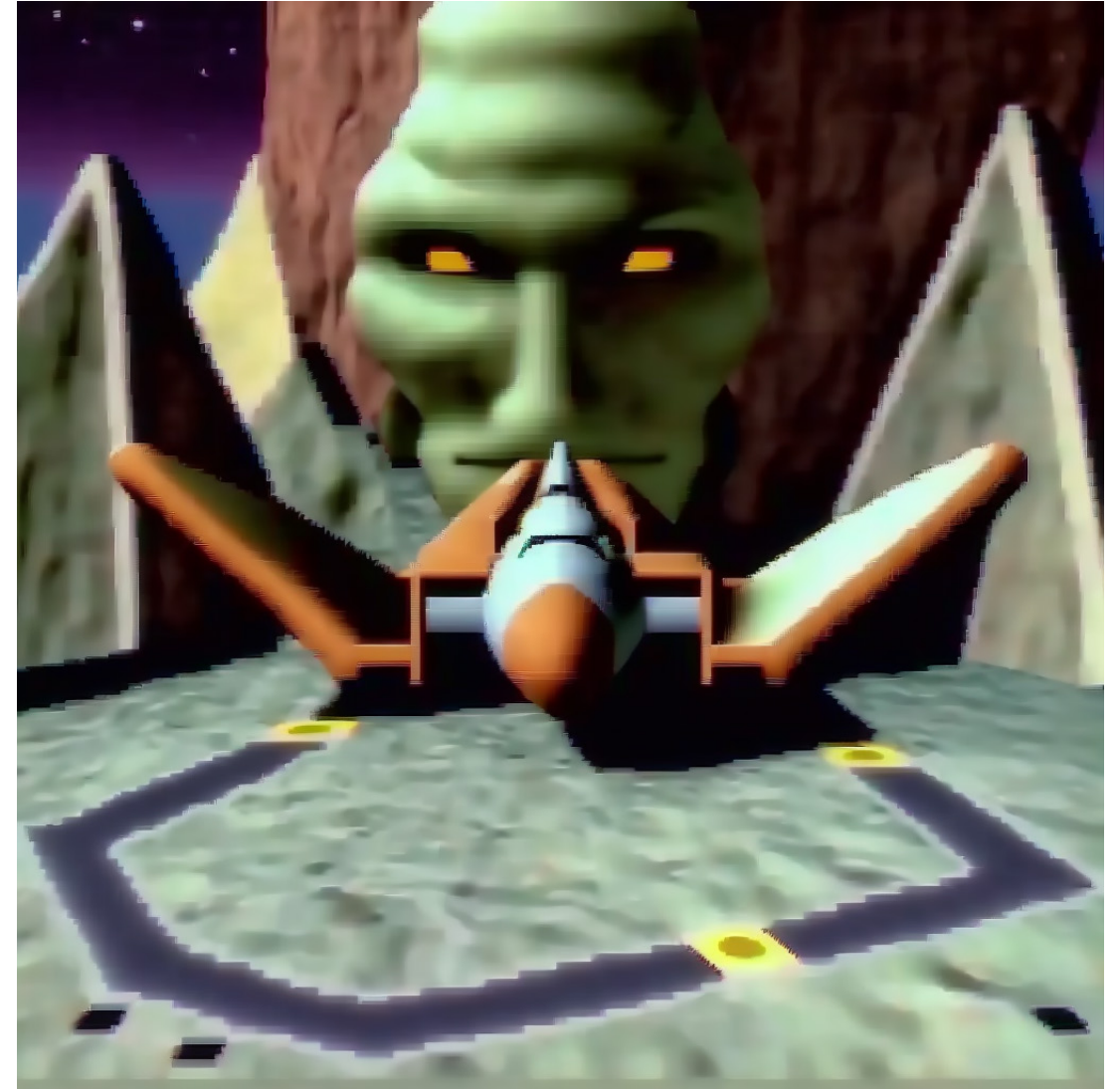
It's Not Rocket Science.