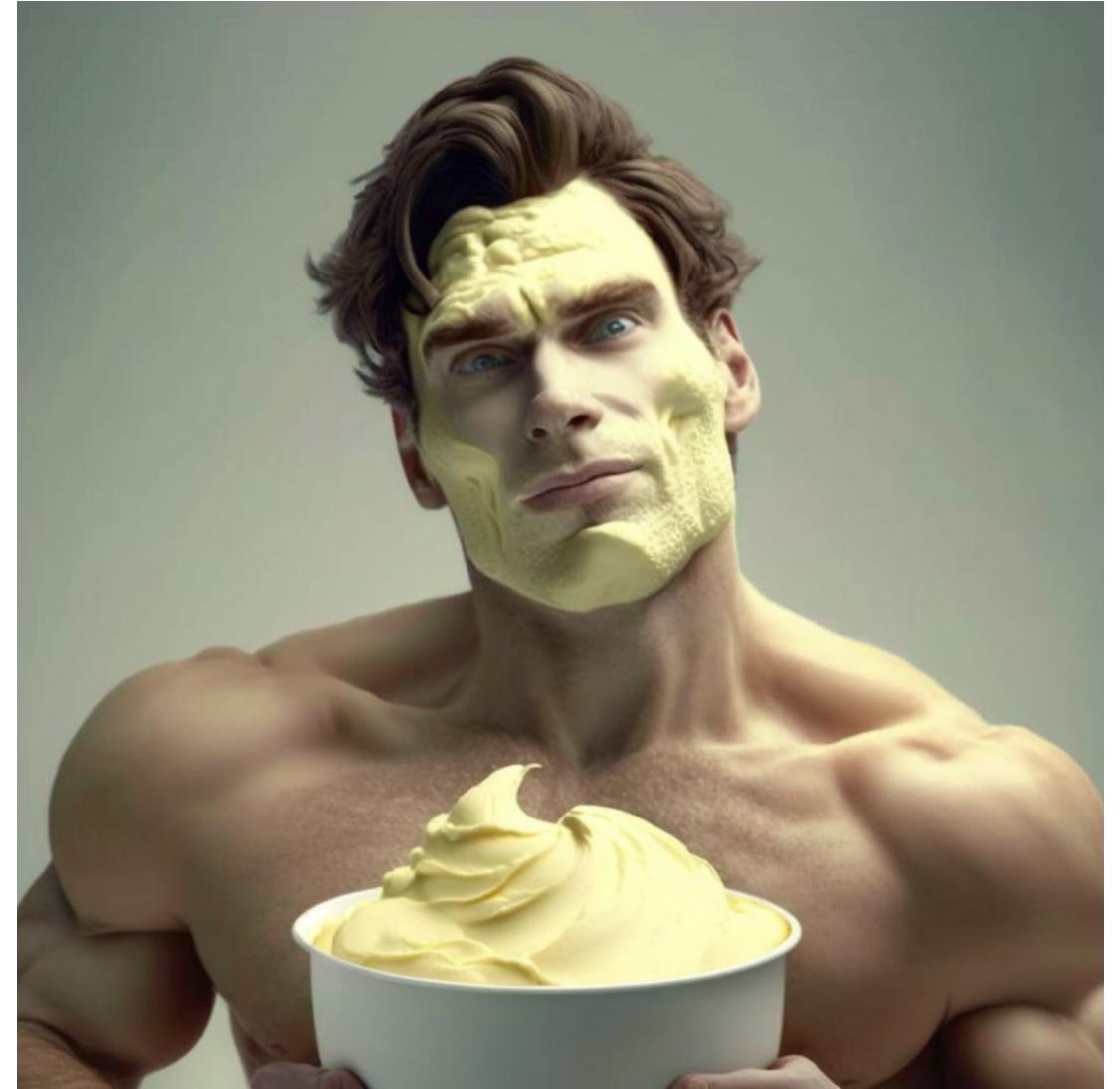
To Butter Someone Up.