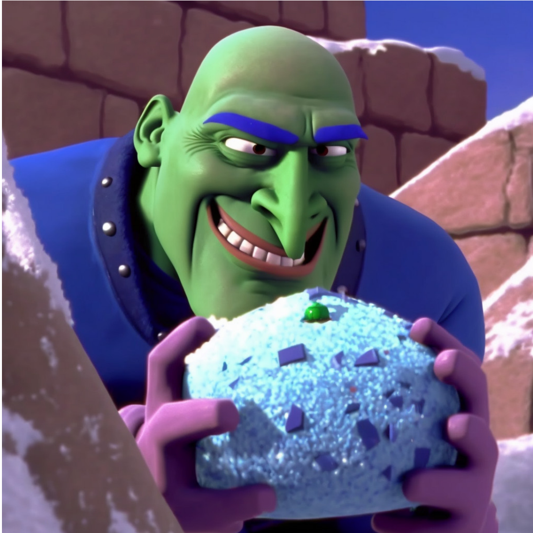
To Give Someone the Cold Shoulder.