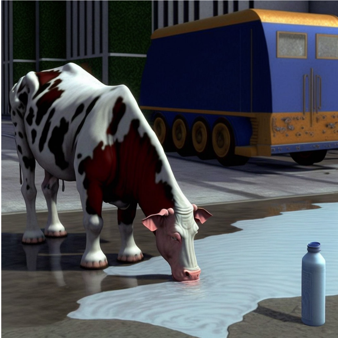
No Use Crying Over Spilled Milk.