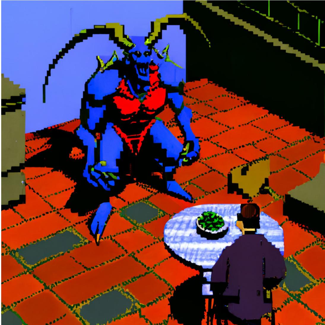
Speak of the Devil.