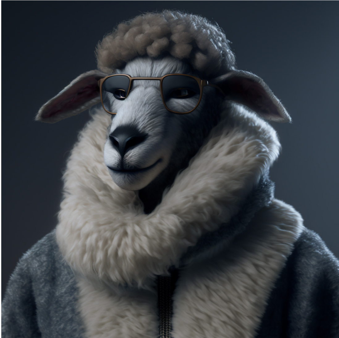
A Wolf in Sheep's Clothing.