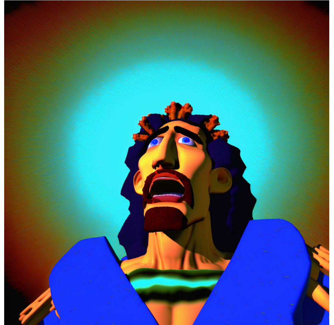
A Blessing in Disguise.