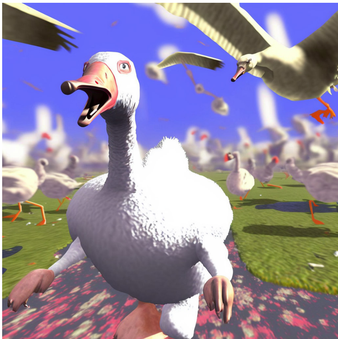
A Wild Goose Chase.