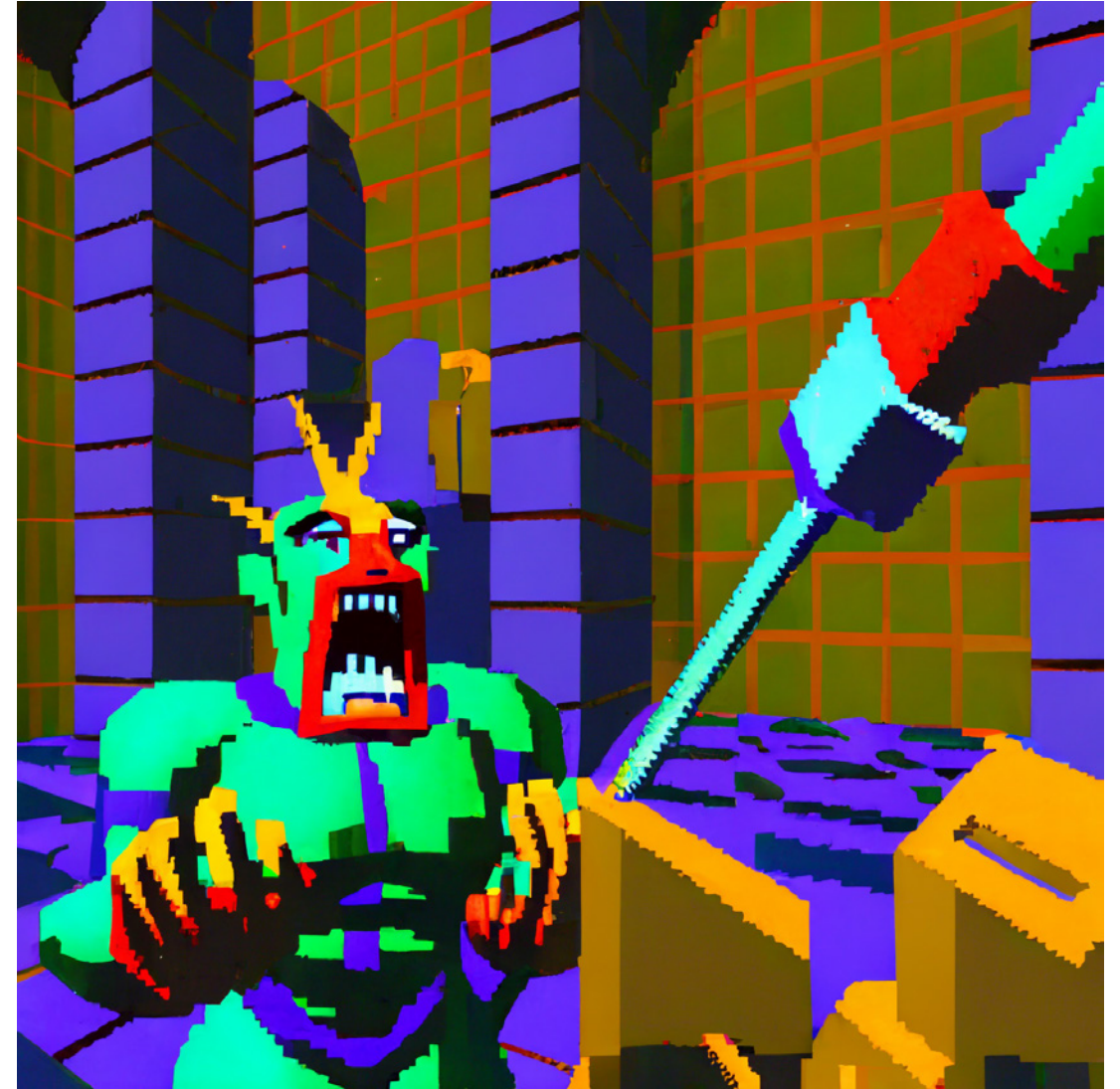
Get a Taste of Your Own Medicine!