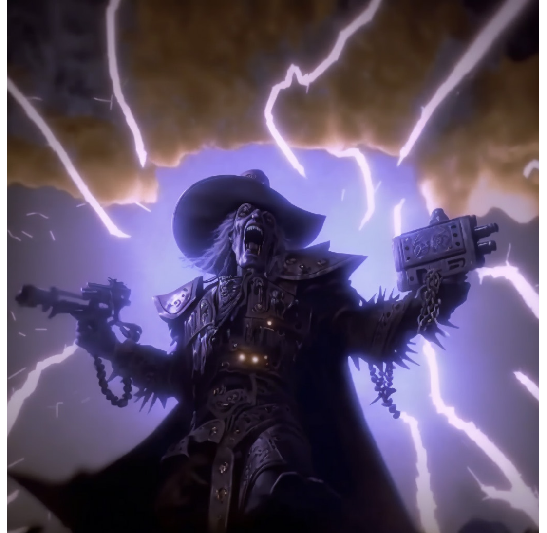
To Jump the Gun.